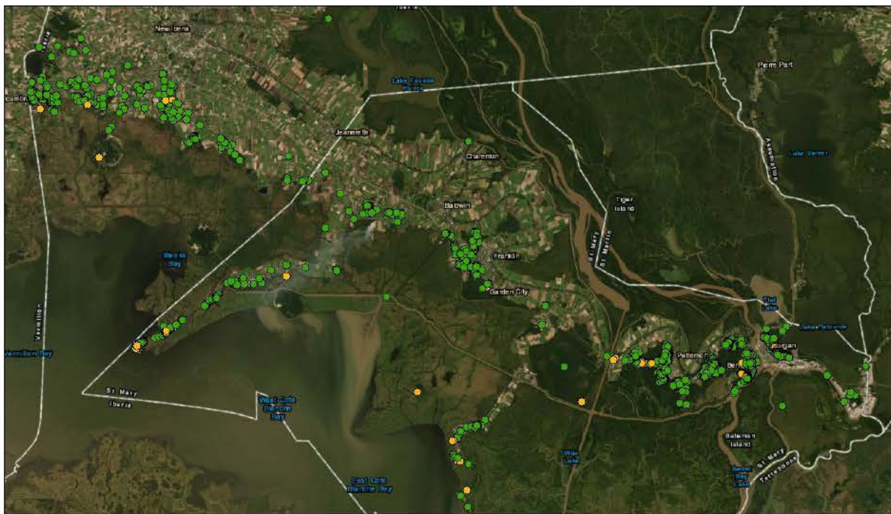
Figure A4:1-2. Nonstructural Plan - 25-Year Floodplain Aggregation (Note: Dots indicate where 25-year flood events occur)